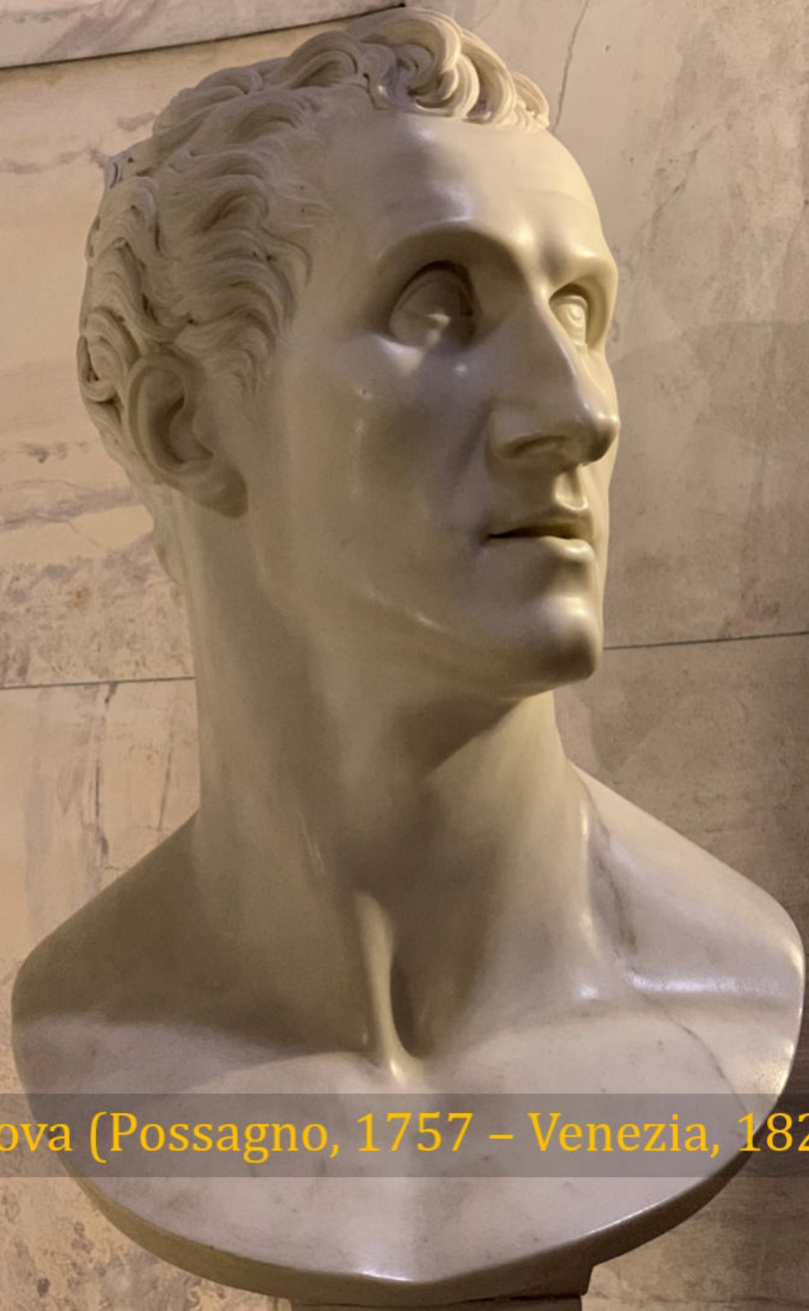
Canova (Possagno, 1757 – Venezia, 1822)