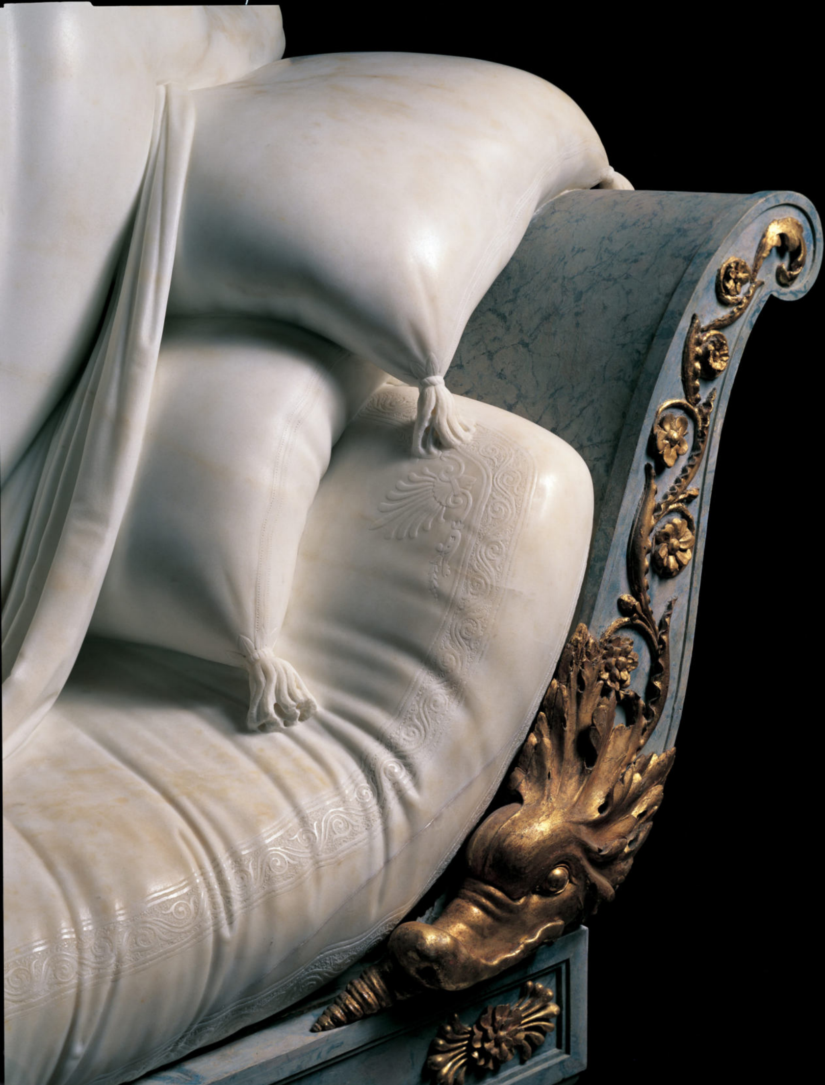
A. CANOVA "VENERE VINCITRICE" (particolare)