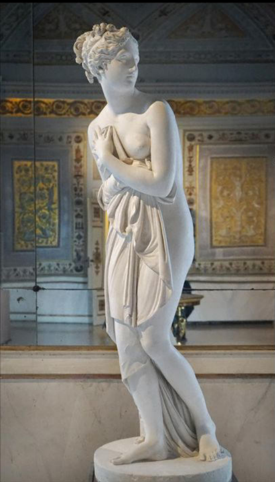
Antonio Canova, Venere italica , 1804-12. Marmo, altezza 1,72 m. Firenze, Palazzo Pitti, Galleria Palatina.